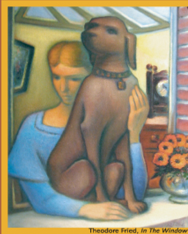
Theodore Fried, In The Window

PIVOTAL MOMENTS IN TWENTIETH CENTURY ART