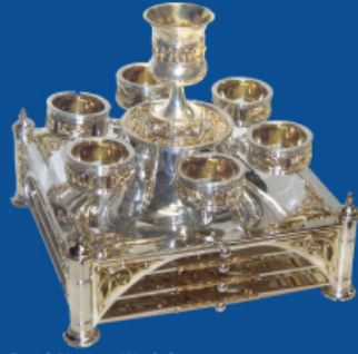
Swed Masters Workshop Passover Seder Plate, Matzah Holder, and Prophet Elijah's Cup Silver, 22K Gold Overlay

This elaborate set is used during the Passover Seder dinner. The pull-out trays hold the three matzot, the round dishes hold the traditional ceremonial foods, and there is a symbolic cup of wine for the Prophet Elijah.